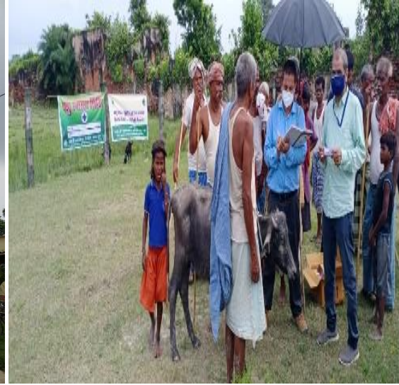
Animal Health Camp