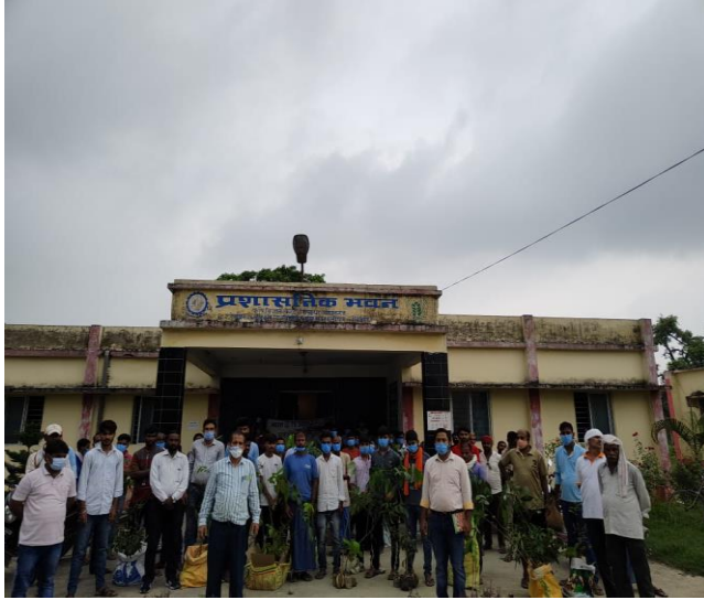
Planting Materials (JSA)