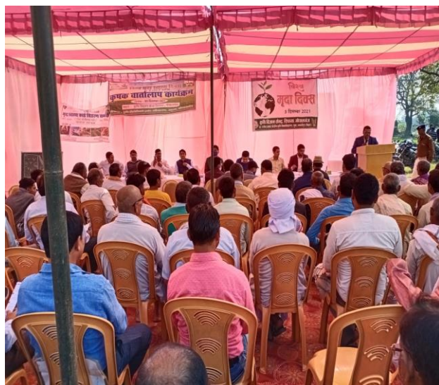
World Soil Day